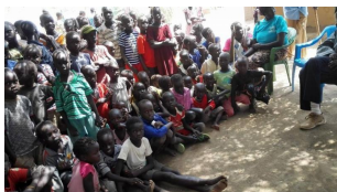
While in Moi's Bridge, we