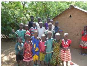
Pictured above are just a few of the children waiting to come in Moisi Bridge.

The Food rations from the WFP are not enough to take them through until the next distribution. The people were so glad we came even if we didn't solve any the problems they experience.