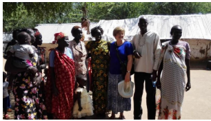
Showing gratitude for the help they have received.

If you are interested in serving in this capacity, let Dixie know. The contacts made during our visit gave us an open door to help in the camp.