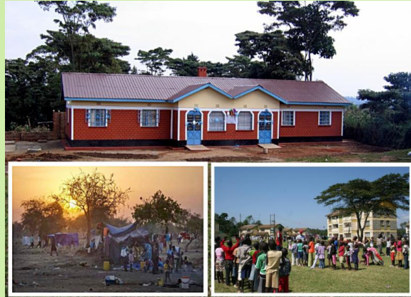
Refugee Camp Apartments in Moi's Bridge

CAP Home (built in 2009) for 40 children/3moms