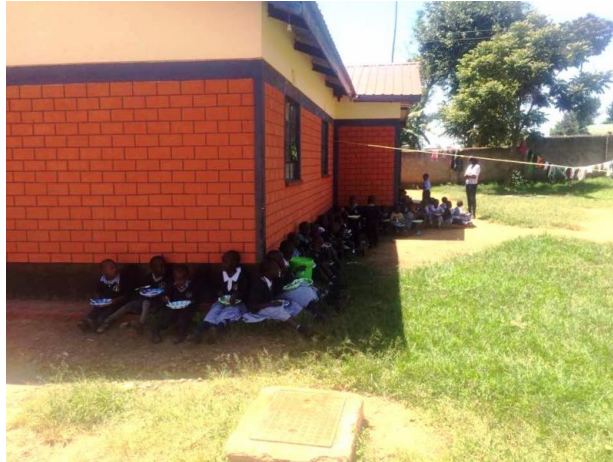
Lunch at CAP School.

We are needing to build a kitchen, dining area and food storage room. The building will be brick like the other buildings on the CAP property with a tin roof. This picture shows the children of the CAP school eating on the ground outside of the CAP children's home. The kitchen of the home is used for the food preparation at this time until the school kitchen is built. Dining on the ground only works when the sun shines-we need that dining hall! About half of the cost is raised, but if you can help, we so appreciate your giving.