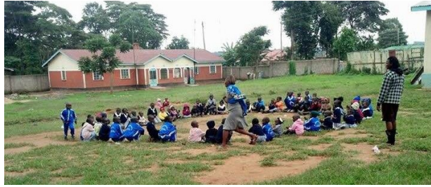
Games for fun.

Butler, IL who sends containers regularly. If we can get the supplies to them, they will do all the paper work and ship the container. The collection of supplies and funds to ship it has begun! Thank you everyone for helping us with this mission.