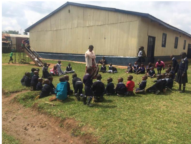
Circle time under the canopy of the heavens.